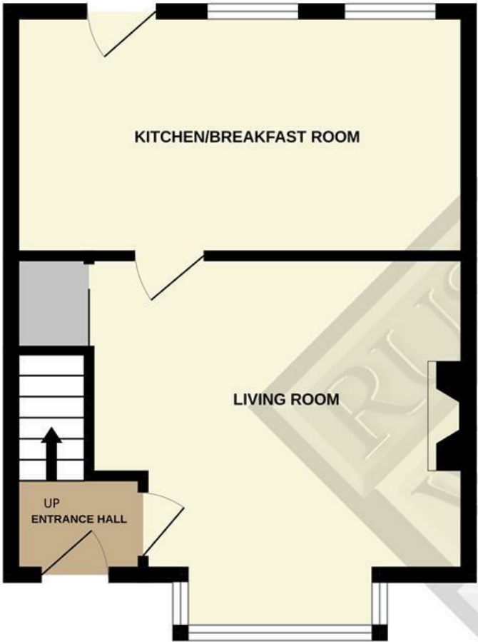
GROUND FLOOR 350 sq.ft. (32.5 sq.m.) approx.